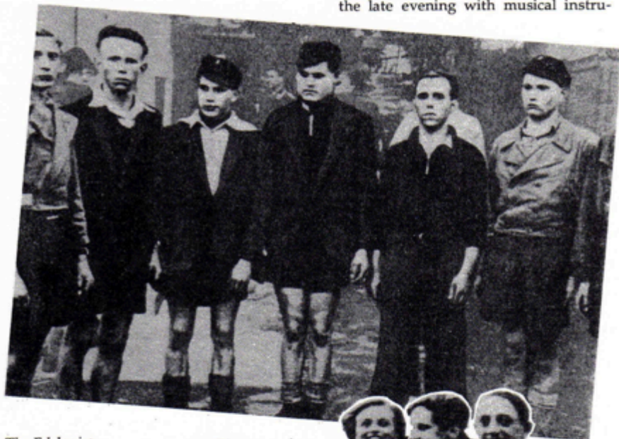
The Edelweiss Pirates developed their own lifestyle, dress, and working-class 'street credibility'. Navajo 'Wild Boys' from Cologne, Easter 1940.

Re: 'Edelweiss Pirates'. The said youths are throwing their weight around again. I have been told that gatherings of young people have become more conspicuous than ever [in a local park], especially since the last air raid on Düsseldorf. These adolescents, aged between 12 and 17, hang around into the late evening with musical instru-