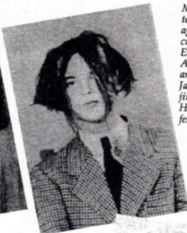
Middle-class teenagers rebelled against Nazi culture by adopting English and American fashions and music. (Below) Jazz and jitterbugging at a Hamburg 'swing' festival 1940.