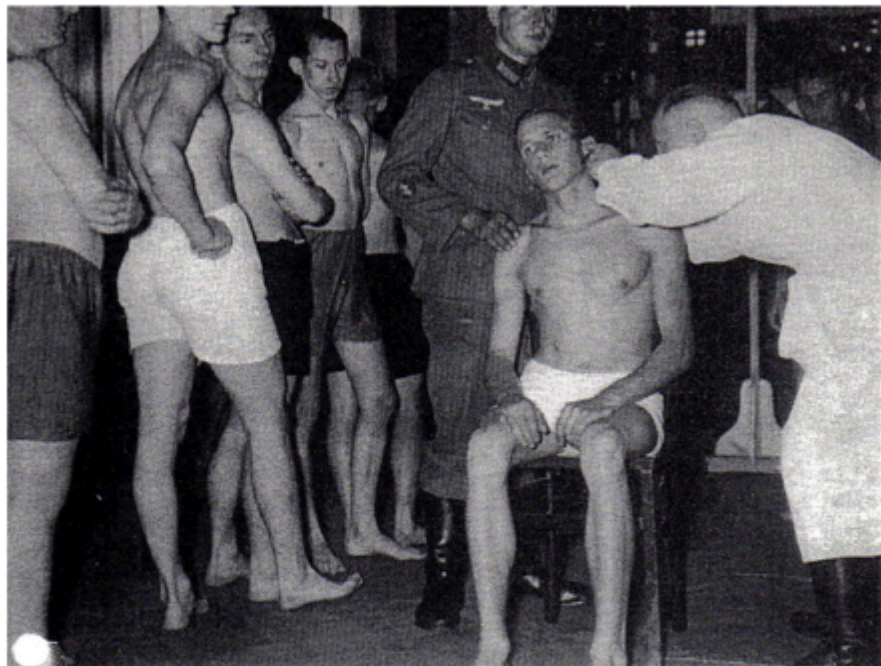
Conscription began to cream off older Hitler Youth leaders as Germany rearmed; 1914-18 'war babies' undergoing medical tests in Berlin.

violent posturing, assertion of their 'legal right' to wipe out the 'shame of Versailles', and risk-taking as a recipe for success.