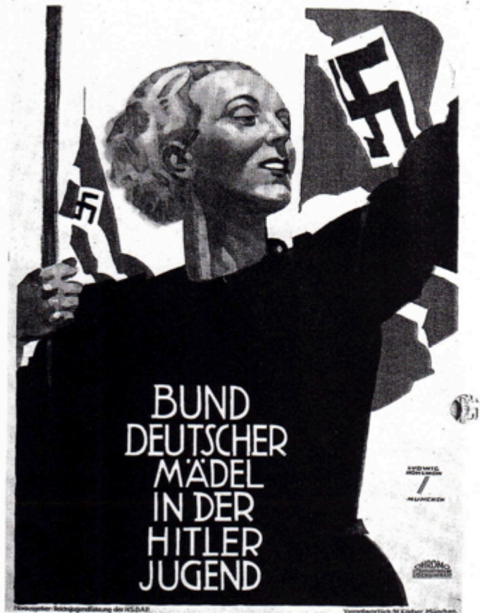
Poster for the 'Bund Deutscher Mädel', women's section of the Hitler Youth.

boys reached the school-leaving age and could thus escape from the immediate, day-to-day sphere of Hitler Youth control. They were taking their first steps into work – as apprentices or, thanks to the shortage of manpower caused by the war, increasingly as relatively well paid unskilled workers. To an increased sense of self-esteem and independence the continuing obligation of Hitler Youth service up to the age of eighteen could contribute very little. The war reduced the Hitler Youth's leisure attractions: instead there was repeated paramilitary drill with pointless exercises in obedience, which were all the more irksome for being supervised by Hitler Youth leaders scarcely any older than the rank and file, yet who often stood out by the virtue of their grammar- or secondary-school background. 'It's the Hitler Youth's own fault,' one Edelweiss Pirate from Düsseldorf said, explaining his group's slogan 'Eternal war on the Hitler Youth': 'every order I was given contained a threat.'