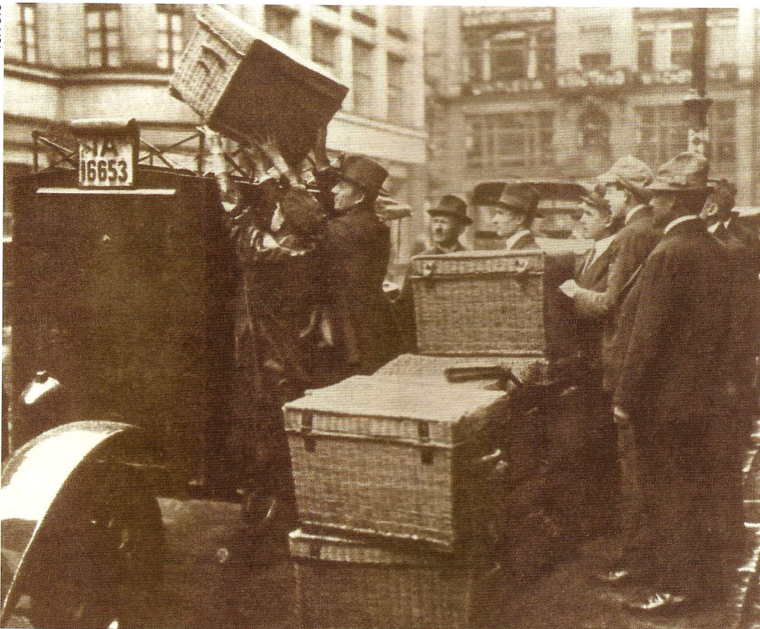
Germans carry inflationary money in laundry baskets, 1923.