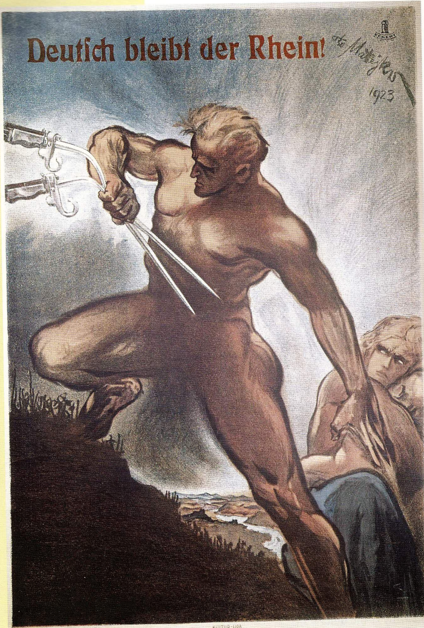
German poster: 'The Rhine remains German!'

entente cordiale: originally the name given to a colonial agreement between Britain and France in 1904, the phrase was used as a more general description of the close relationship that existed between Britain and France during the first half of the twentieth century.